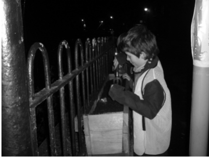
Hard at work! - Croston Scouts working in the dark to plant the bulbs