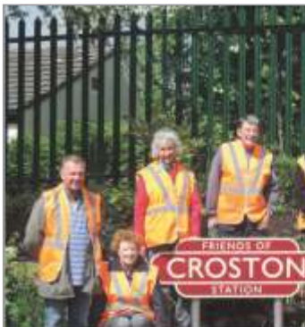
The Friends of Croston Station

The previous evening had seen the village pick up four awards in the RHS 'It's Your Neighbourhood' categories with Croston Station, Church Street and