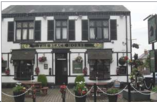
The Black Horse in all its glory

In what was a very eventful afternoon at the Awards Ceremony, The Black Horse was also awarded a Gold Medal and Croston was nominated to represent the North West in next year's Britain in Bloom competition! More of that later.